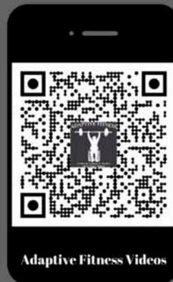
Adaptive Fitness Videos