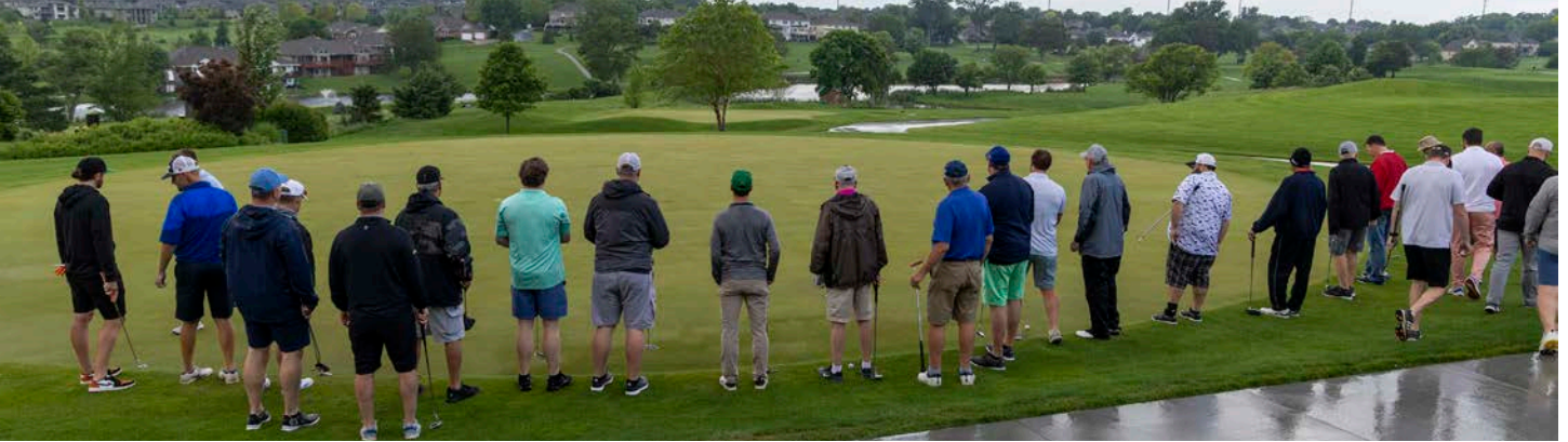
Above: Golfers line up for the Mega Putt contest. Below: Golfers wave to our photographer, Don Labrie, as they head out to their first hole to tee off!