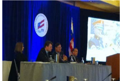
Senate & House VA Committees Panel

Every year, PVA prioritizes current issues that are most important to its members and the disability community as a whole. This year, there are ten issues on which PVA is focusing its efforts. I've highlighted the top three below: